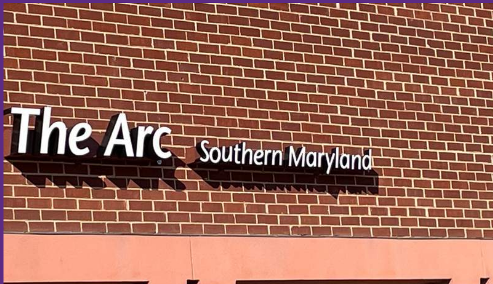
PICTURED: LOGO SIGN BEING INSTALLED AT NEW OFFICE

Our Charles County office was bursting at the seams and so a new building was purchased in Waldorf that allows enough space for all existing programs and services as well as some expansion. As we move into 2023, plans are already underway to build out a commercial grade teaching kitchen where people we support will learn hands on culinary skills in a professional environment, thanks to grants from both The TJX and Maria Grazia Panero Foundations. Our new space will also house a laundry facility which will be used in conjunction with our kitchen to provide life skills practice and training.